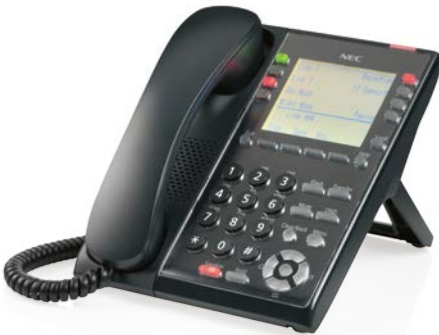
SL2100 IP Terminal