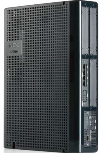
SL2100 Communications Server