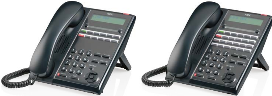
SL2100 Multi-line Terminals