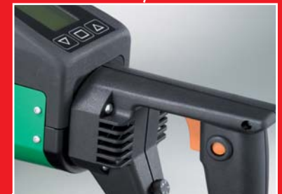
Ergonomic handle allows to weld in upright position