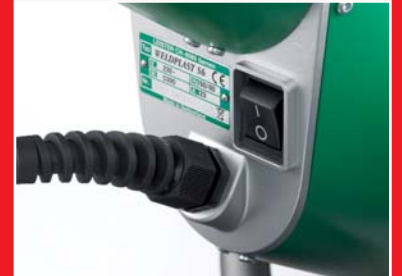
Completely integrated in «bullet proof» housing