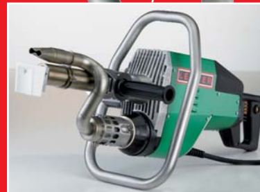
«Steering wheel» handle designed by welders