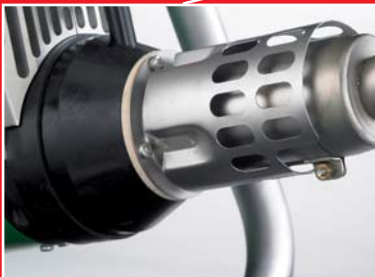
Maintenance free blower