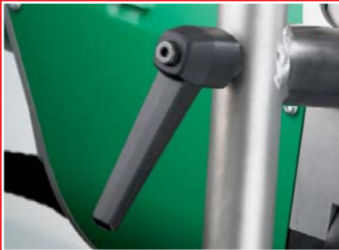
Symmetrical handle fixation mountable left and right